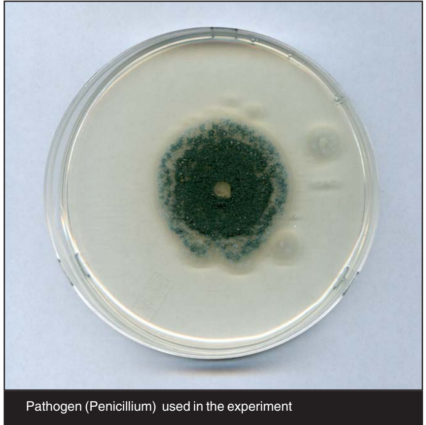
Pathogen (Penicillium) used in the experiment