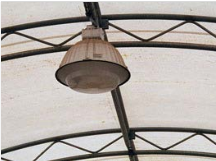
Lighting is sometimes used in hoops where animal care or inspection might occur after dark.