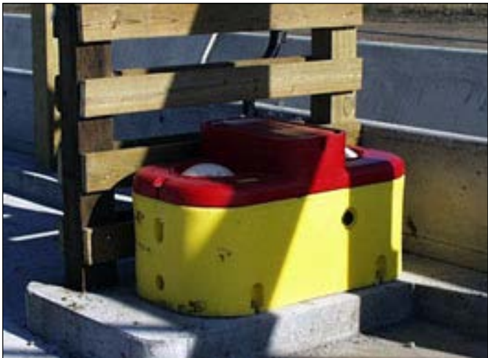
Frost-free waterers are used near the bunks.