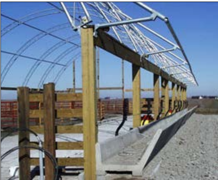
A feed bunk is placed outside of the wall to eliminate the expense of an interior drive alley. An overhang is added to reduce the rainwater entering the bunk. It is calculated for one foot of feed bunk per head.