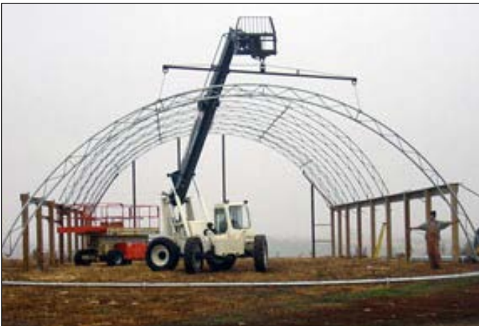
Hoop barns are constructed using steel arches mounted on wood or concrete sidewalls.

The following images highlight some of the key features that make hoop structures innovative and technologically sound. These pictures come from the ISU Armstrong Research and Demonstration Farm near Lewis, Iowa. A portion of the funds to build the barn came from a Leopold Center special project grant.