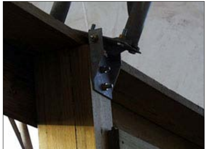
The steel arches are securely fastened to the sidewall to transmit the wind forces to the sidewalls and the ground.