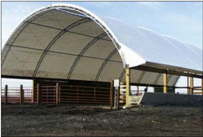
Tarps are designed to reflect solar radiation to prevent heat stress. White tarps tend to make the interior less dark.