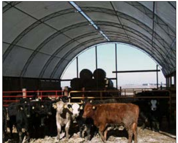
When the building length is more than three times its width, a ridge vent in the hoop structure helps to promote good airflow, reducing humidity during the winter and removing excess heat in the summer.