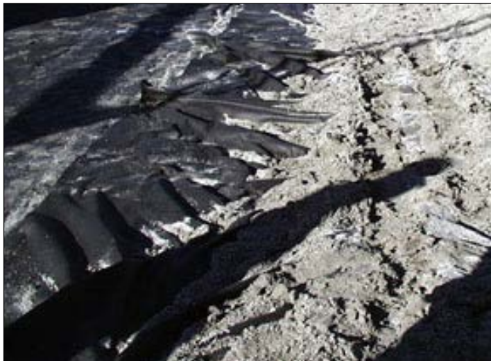
Limestone screenings packed over geotextile materials can serve as a portion of the floor which will be scraped less and bedded more heavily.