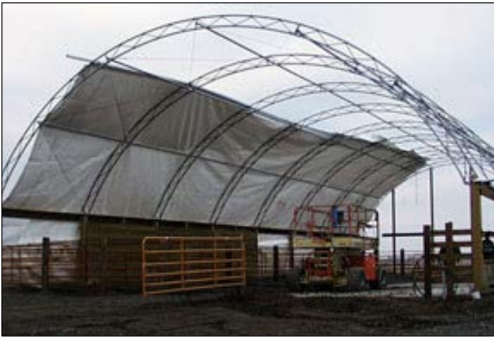
A polyethylene/PVC fabric tarp is stretched over the steel framing to form the roof.