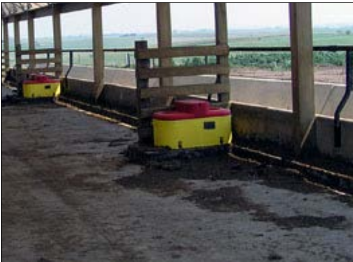
Concrete is sloped 1/2 inch per foot away from the bunk to help work manure away from the feed bunk.