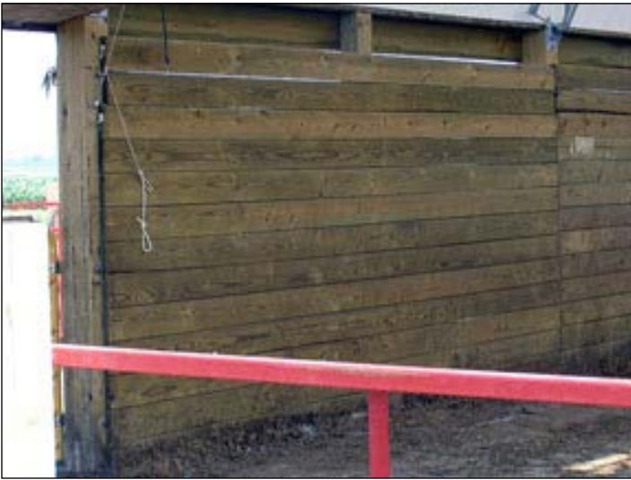
To prevent the afternoon sun from penetrating deep into the building and causing heat stress, the west wall is enclosed.