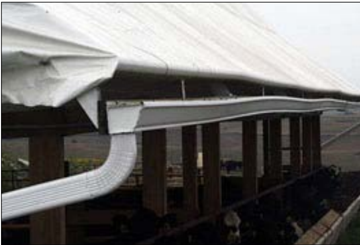
A rain gutter is added to the overhang to channel rainwater away from the feed bunk.