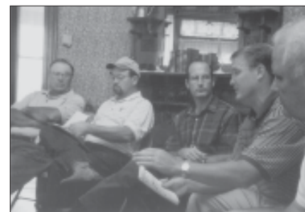
Vets’ Circle discussion before a field day.