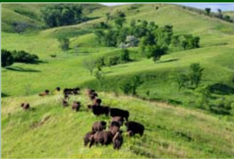
Grazing the Prairie