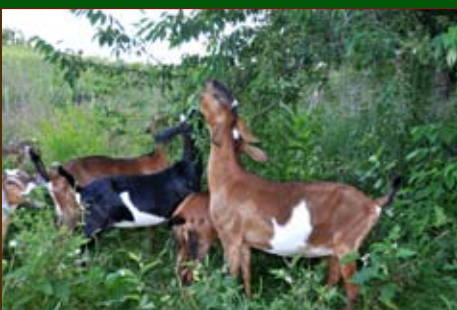
Goats Clean Up

Funds for this project have been provided to the Grass-Based Livestock Working Group by the Leopold Center for Sustainable Agriculture.