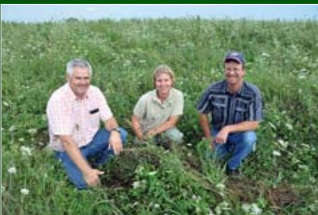
CRP in Rotation