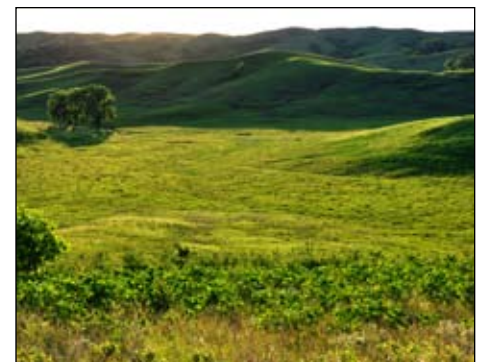
Broken Kettle is in the Loess Hills region of western Iowa.